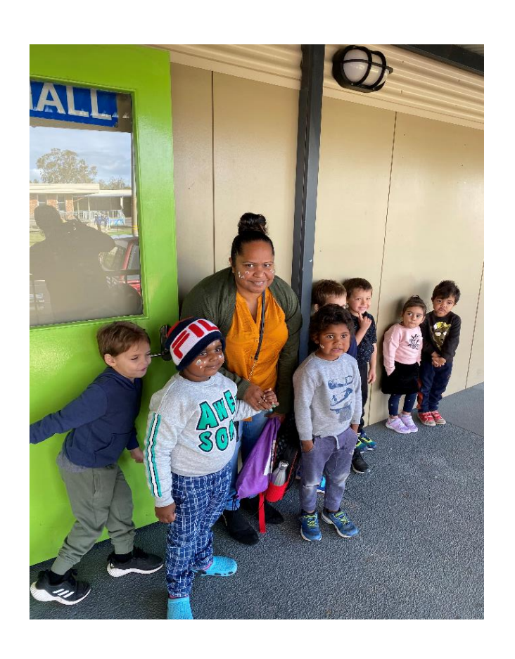
Our little friends from Pre-School really enjoyed the show and had lots of fun painting on white ochre