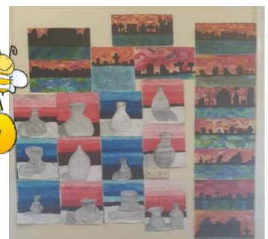
Creative Arts using water colours