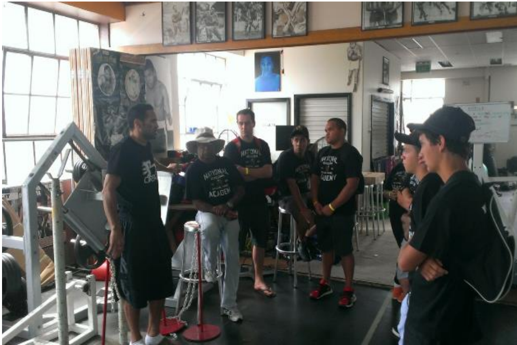
Students attending a motivation speech by Anthony Mundine